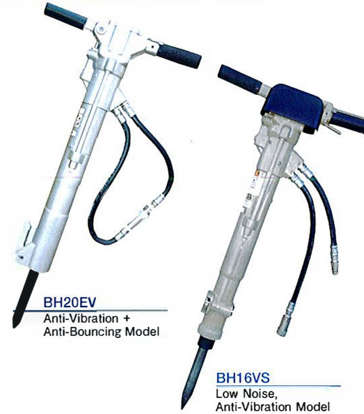
BH20EV Anti-Vibration + Anti-Bouncing Model