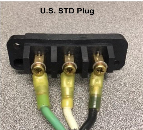
U.S. STD Plug

The U.S. STD (Standard, EP30) Plug Does NOT have any specific wiring pattern. The HBM Series vibrator is a 3 phase motor, allowing it to run CW or CCW. Take note of the special "epoxy" heat shrink wire connectors which insure proper wire connection.