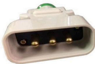
EP30 Standard Plug (000)