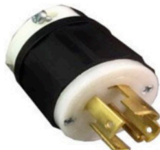
Twist Lock Plug (010)

Available in Standard & Twist Lock Plugs