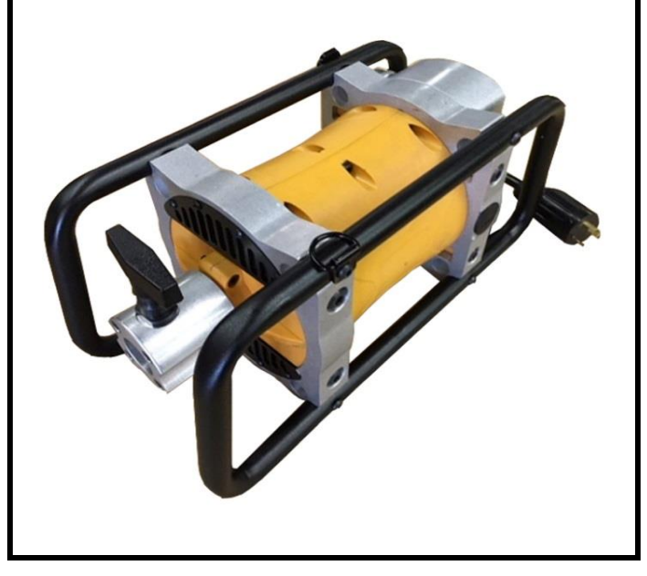
3 1/4 Hp ... Just 18 LBS.